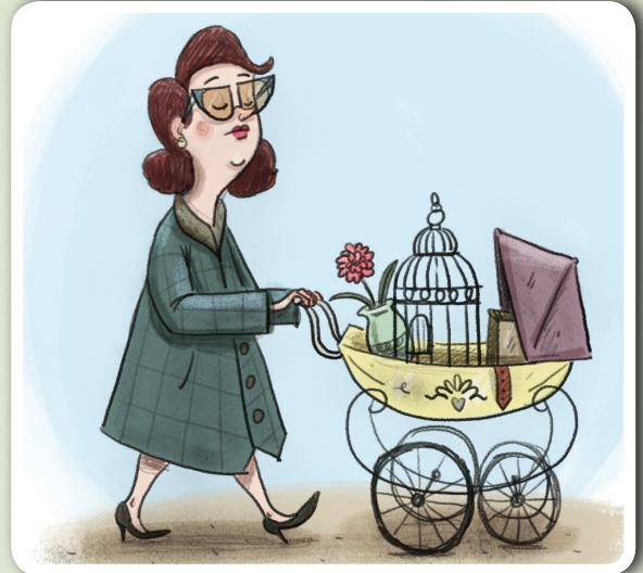
Dora the Storer